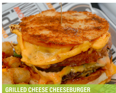
GRILLED CHEESE CHEESEBURGER

MASHED POTATOES & GRAVY | DIRTY RICE | LOADED FRIES* | LOADED TATER TOTS* | SIDE SALAD | MAC N CHEESE | JAMESON GLAZED BRUSSEL SPROUTS *CONTAINS NUTS