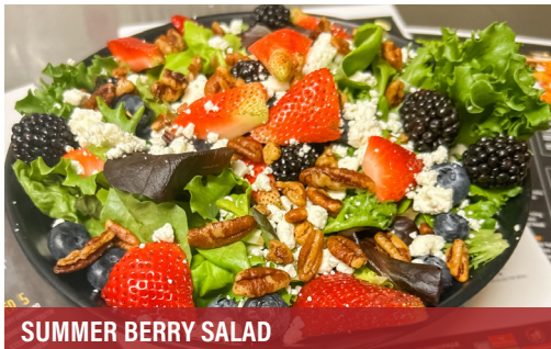
SUMMER BERRY SALAD