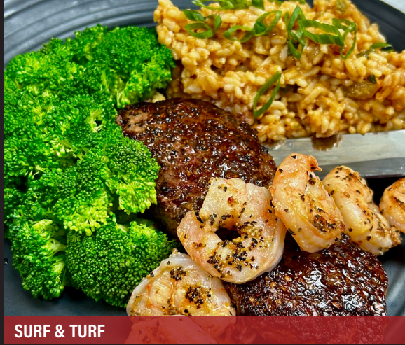
SURF & TURF

Two grilled chicken breasts covered in our thick Jameson whiskey glaze. Served with your choice of two sides.