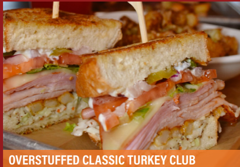
OVERSTUFFED CLASSIC TURKEY CLUB

CHICKEN CLUB FLATBREAD* 13.99 Grilled chicken topped with Swiss cheese, bacon, lettuce, tomato, and garlic ranch on a grilled flatbread.