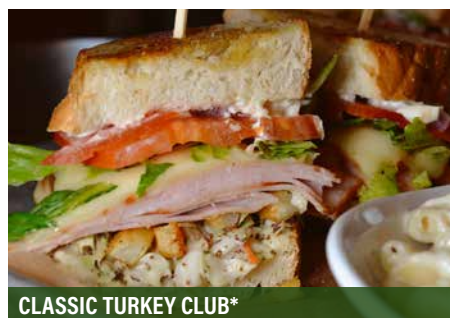
CLASSIC TURKEY CLUB*

Grilled chicken topped with Swiss cheese, bacon, lettuce, tomato, and garlic ranch on focaccia bread.