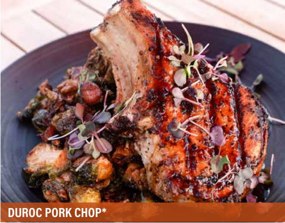
DUROC PORK CHOP*

Two grilled chicken breasts covered in our thick Jameson whiskey glaze. Served with your choice of two sides.