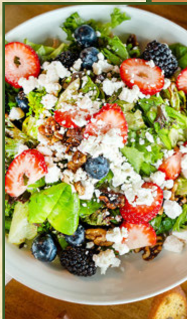
SUMMER BERRY SALAD

Ohio grown spring mix topped with assorted berries, candied pecans, crumbled goat cheese, tossed in raspberry vinaigrette.