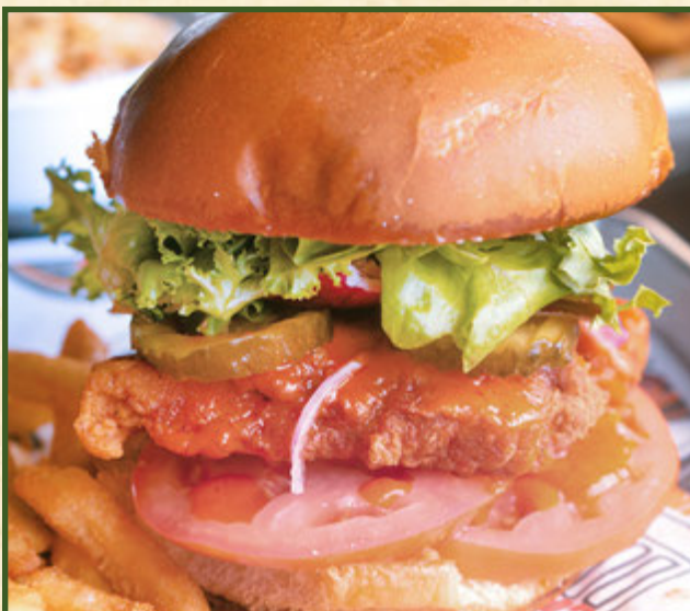
SPICY BUFFALO CHICKEN SANDWICH

Grilled chicken topped with Swiss cheese, bacon, lettuce, tomato, and garlic ranch served on toasted focaccia bread.