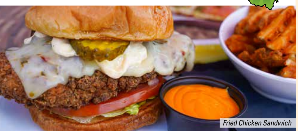
ALL SANDWICHES SERVED WITH A SIDE OF YOUR CHOICE

LOADED FRIES/TOTS | FRIED PICKLES | MACARONI & CHEESE BITES | CHICKEN TENDERS | REUBEN ROLLS | MOZZARELLA STICKS