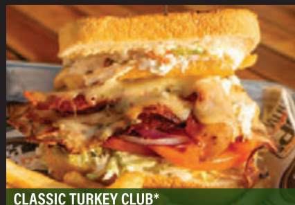
CLASSIC TURKEY CLUB*

Shaved sirloin, waffle fries, shredded lettuce, garlic ranch, and cheddar jack & mozzarella cheese on a toasted hoagie.