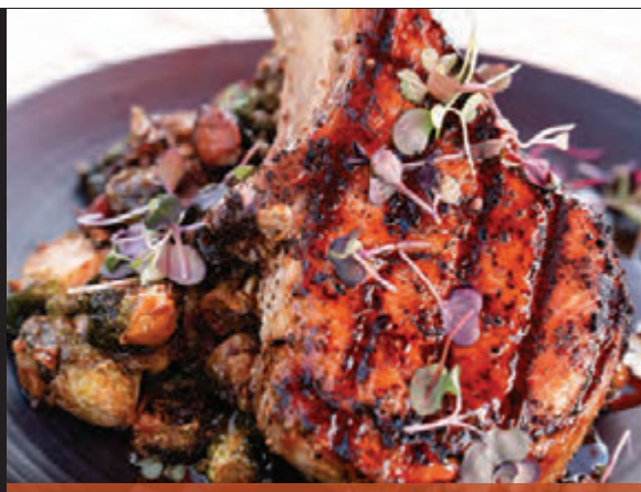
DUROC PORK CHOP*

Two grilled chicken breasts covered in our thick Jameson whiskey glaze. Served with your choice of two sides.