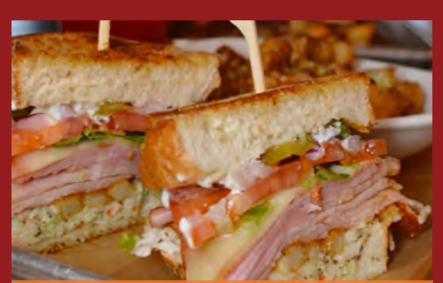
OVERSTUFFED CLASSIC TURKEY CLUB

Grilled chicken topped with Swiss cheese, bacon, lettuce, tomato, and garlic ranch on a grilled flatbread.